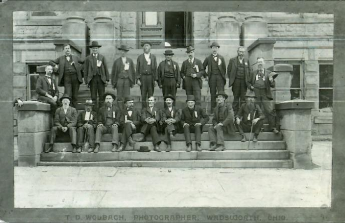
The Nineteenth Regimental Reunion 16th Ohio Volunteer Infantry Millersburg, Ohio September 19-20, 1894

The Grand Army of the Republic (G.A.R.), a prominent veterans organization, also held annual reunions known as "encampments," with one significant example being the 35th National Encampment in Cleveland in 1901. A particularly late reunion of Ohio Civil War veterans took place in 1941 in Clyde, which also included the dedication of General McPherson Highway. These reunions often included recitations of veterans' experiences, music, and family participation, reflecting the lasting bonds formed during the war and the community built around these gatherings.