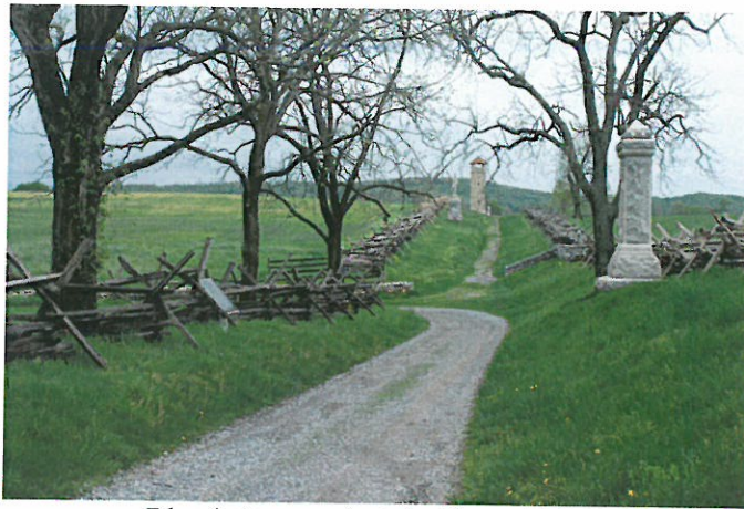
Bloody Lane